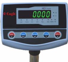
Indicator Front Panel