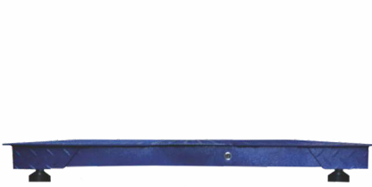
Small Platform Height